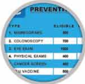
Preventive Care Measures